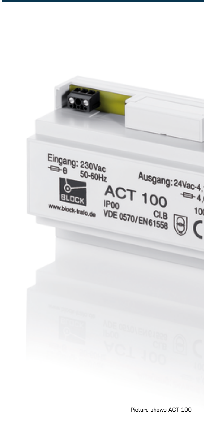
Picture shows ACT 100